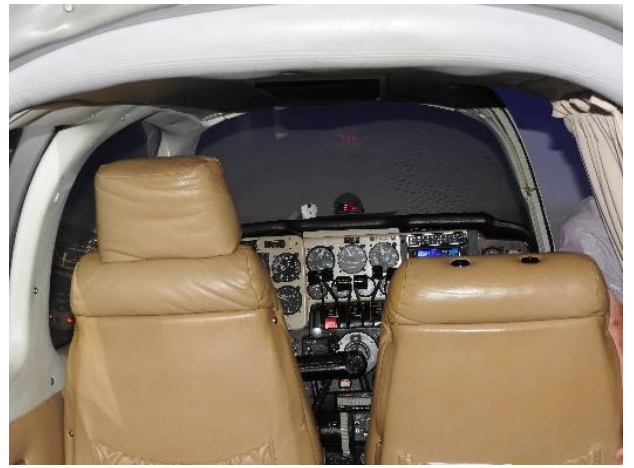
Cockpits of the simulators are constructed just like the real aircraft with all the instruments and controls. This is the cockpit of the Beechcraft Baron T 42.