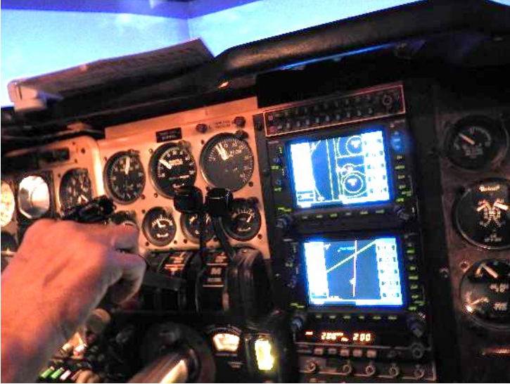
In simulated flight mode the instruments and controls respond to the pilots inputs just like a real aircraft.